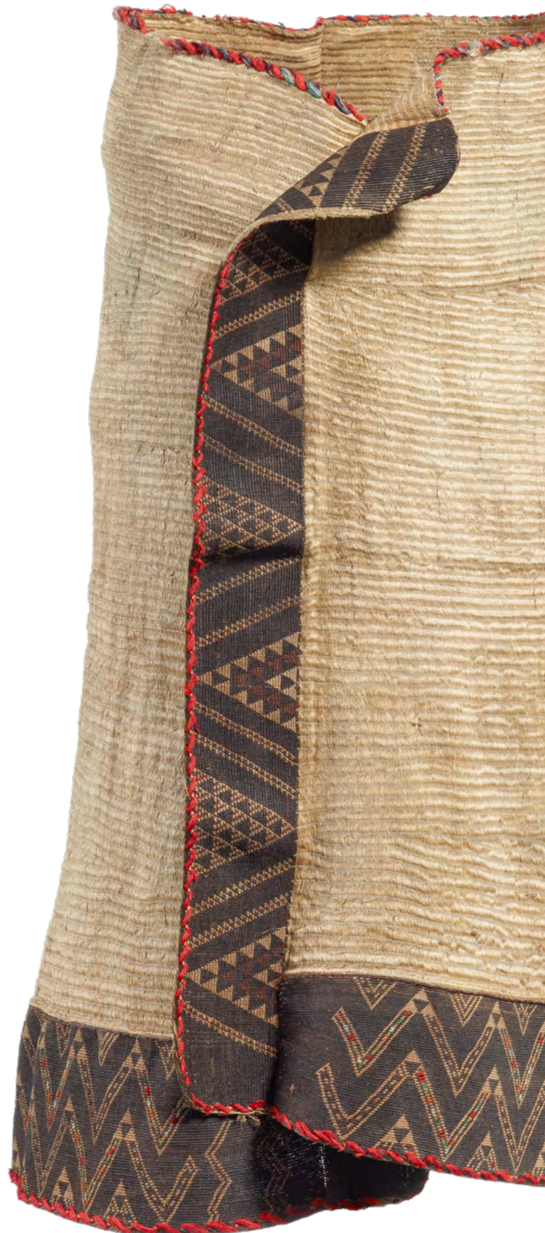
Figure 2 Kaitaka aronui (cloak), Nelson Bays, maker unknown. Gift of Mrs T.S. Adams, date unknown. Te Papa (ME003788)

Kaitaka Paepaeroa is the kākahu that keeps the voice of the people warm.