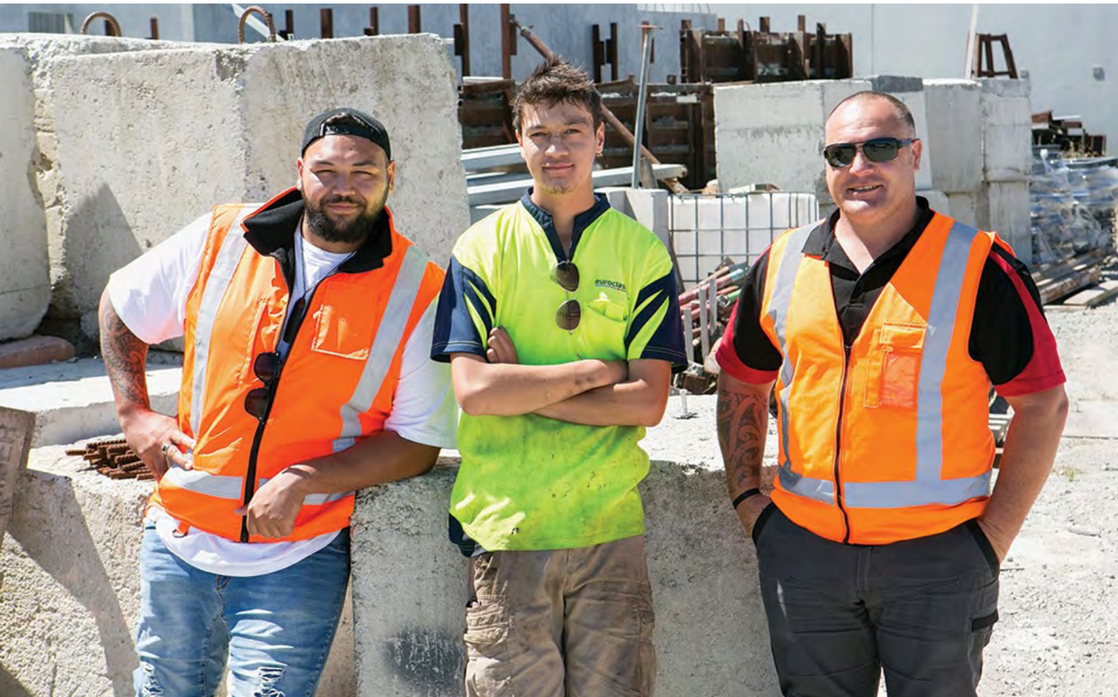
Figure 3 He Toki Māori Trade Training representatives.

Despite the Māori Trades Training scheme having been disestablished over 20 years ago, its legacy has carried on through mainstream and Iwi trades development.