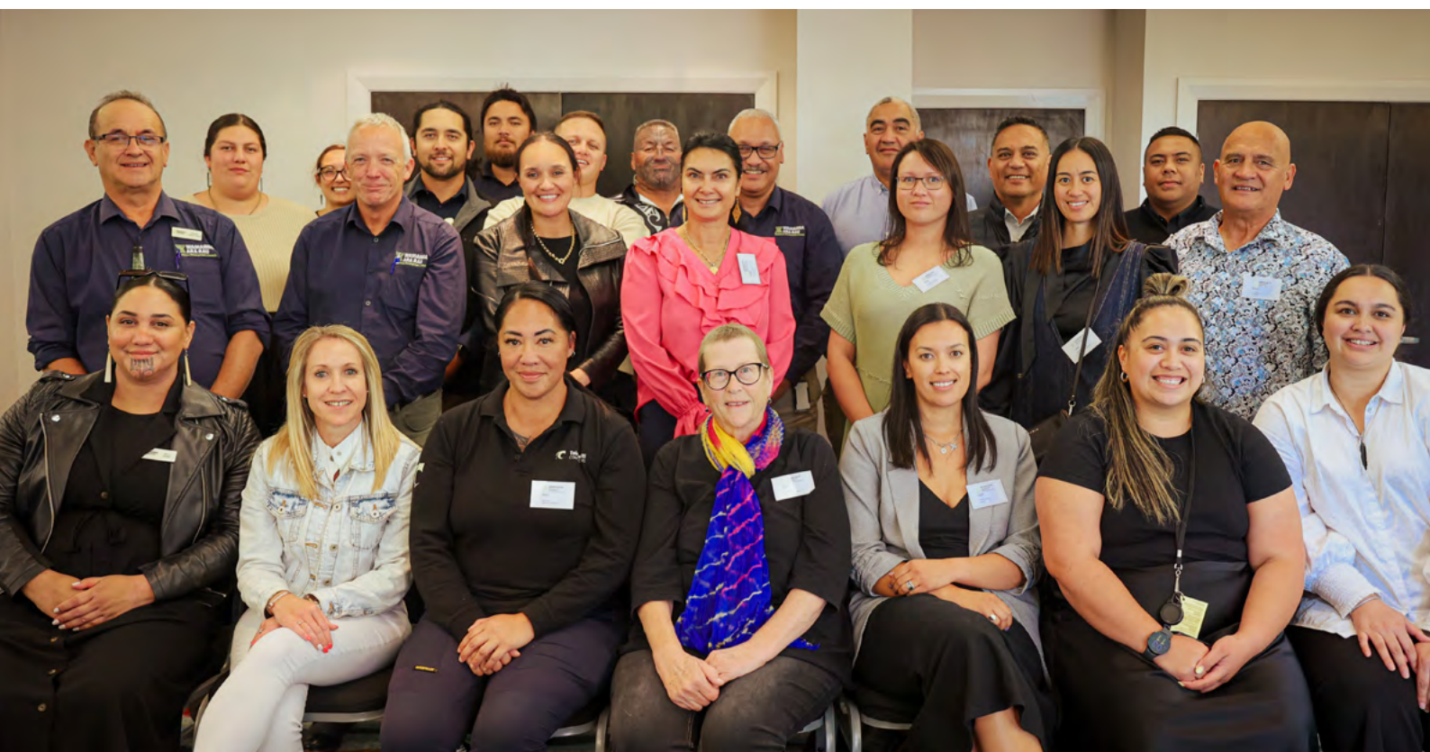
Figure 1 Kaitaka Paepaeroa Māori Advisory Group

Incorporating these practices into future research projects can help ensure that research is conducted in a manner that is both timely and ethical, ultimately enhancing the credibility and impact of the findings to ensure that the research is conducted with integrity.